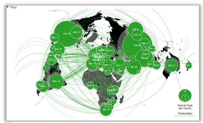
Figure 1: Screenshot of the living data visualization tool

The living systematic review identifies weekly new trials, and all data are extracted in duplicate, assessed for risk of bias, and analysed biweekly. We produce forest plots for